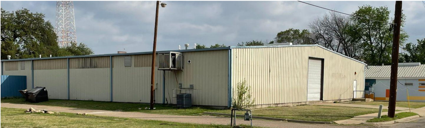
Adjacent building; mural by Gabrielle Storey