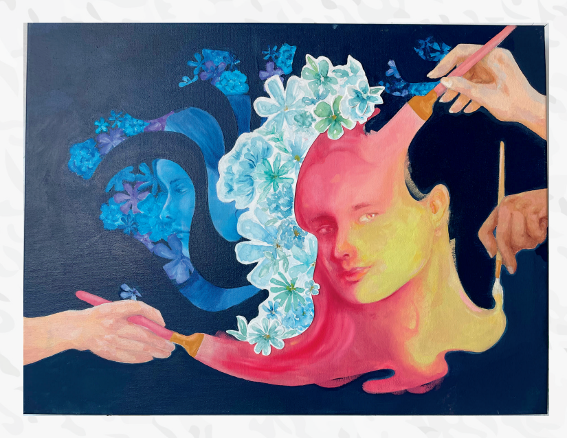
CLARITY Lucy Ward Oil on canvas, diptych $400

The first stage of our life starts with others defining who we are. The people around us hold the paintbrush and paint who they want us to be.